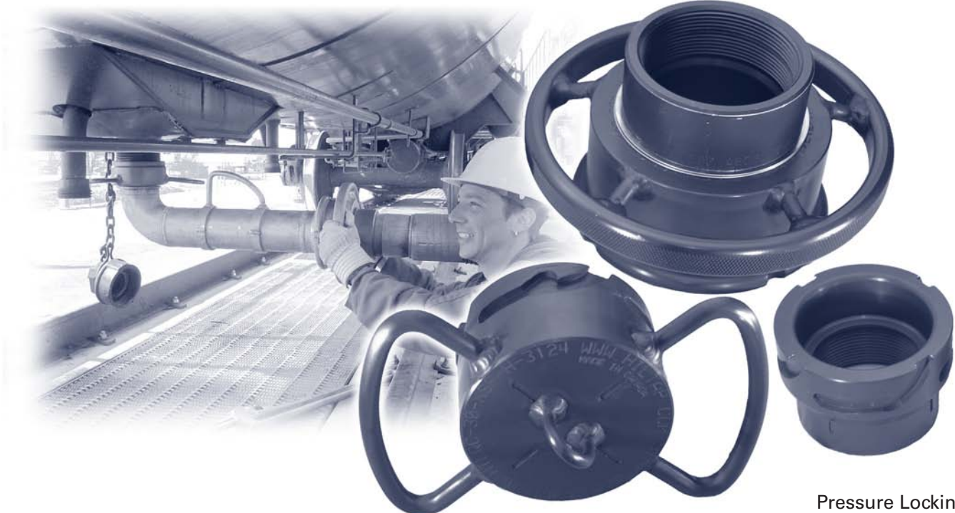
Pressure Locking Patented, other patents pending